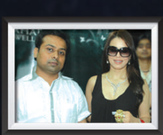
MS. MAHIMA CHOUDHRY (BOLLYWOOD ACTRESS)