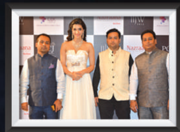
MS. KRITI SANON (BOLLYWOOD ACTRESS)