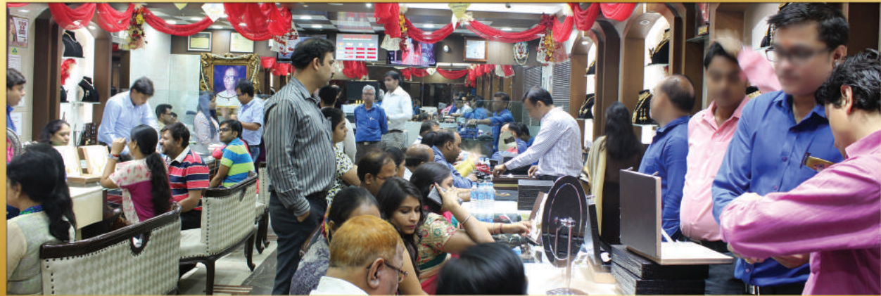
1. Kolkata - City Center 1, Flagship Showroom