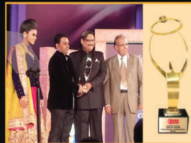
IJ JEWELLERY CHOICE DESIGN AWARD 2014