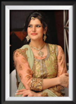
MS. ZARINE KHAN (BOLLYWOOD ACTRESS)