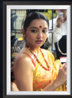
MS. JUNE MALIA (TOLLYWOOD ACTRESS)