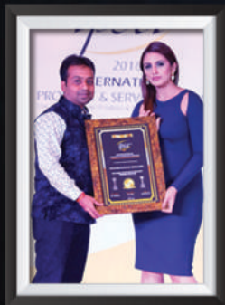
MS. HUMA QURESHI (BOLLYWOOD ACTRESS)