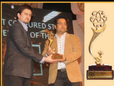
NATIONAL JEWELLERY AWARD