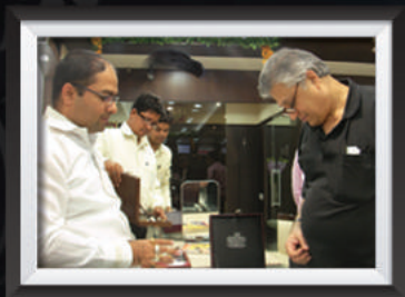
MR. SHIV KHERA (RENOWN AUTHOR AND SPEAKER)