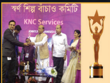
CONSUMER CHOICE AWARD