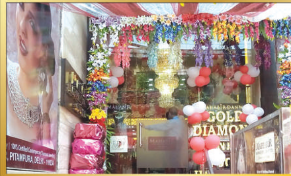
3. Delhi - Pitampura Showroom