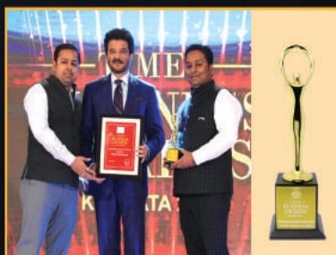
TIMES BUSINESS AWARD