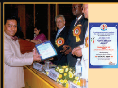
UDYOG BHARATI AWARD