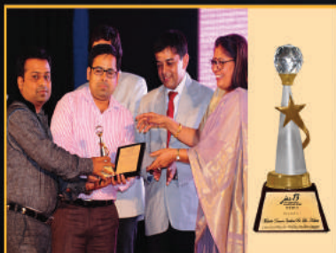
JAS JEWELLERY DESIGN AWARD