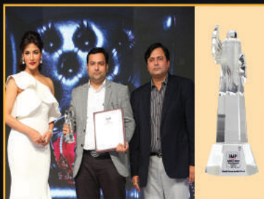
INDIA'S MOST PREFERRED JEWELLERY AWARD