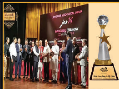
JAS JEWELLERY DESIGN AWARD