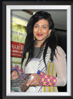
MS. RITUPARNA SENGUPTA (TOLLYWOOD ACTRESS)