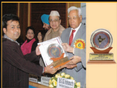
INTERNATIONAL QUALITY EXCELLENCE AWARD